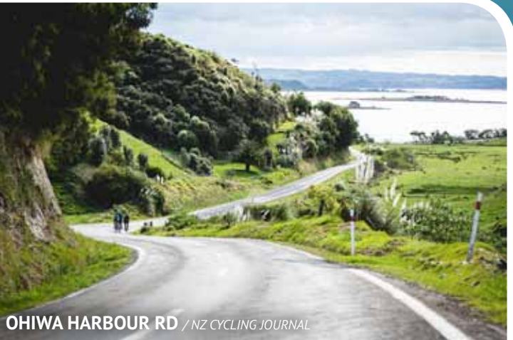
OHIWA HARBOUR RD / NZ CYCLING JOURNAL

From Waioeka SH2 bridge, you can ride back roads to the SH2 bridge by Ohiwa Beach Road, this route is hilly and has 3km of gravel. From Ohiwa Beach Road you can ride over a steep hill to Ohiwa Harbour, then loop around the eastern and southern end of the harbour. There's another loop south of Opotiki, where you can link Otara, Otara East, and Gault roads. Otara East is undulating with 4km of gravel, the rest is flat and sealed.